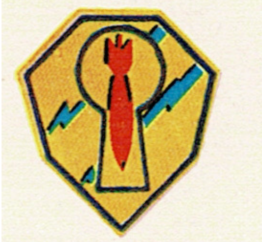
7 Observation Squadron emblem